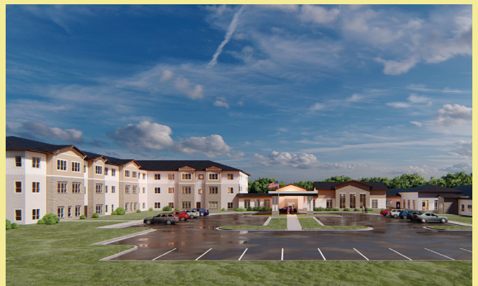
The new Harmony Gardens campus will include independent and assisted living, memory care and care suites.

The new community, called Harmony Gardens, will offer skilled nursing and senior living neighborhoods including independent and assisted living, memory care and care suites. Numerous amenities will be available throughout the campus.