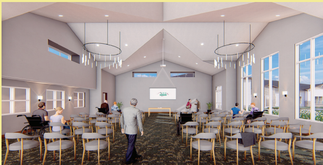
Harmony Gardens chapel rendering