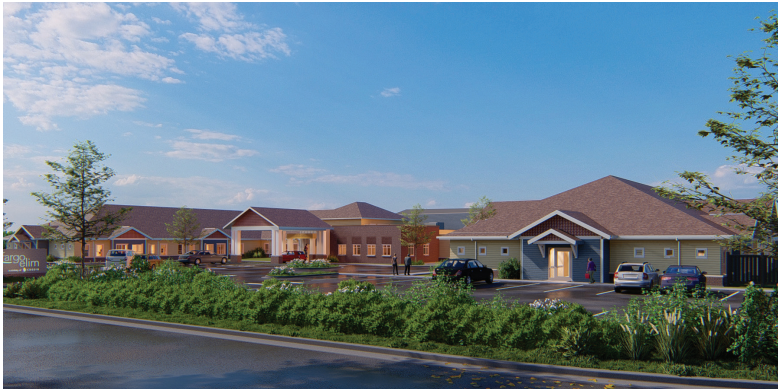
Cassia's new Fargo Elim building will offer a four-seasons porch and many other amenities.

Though damaged by fire in 2020, Cassia's Fargo Elim community is now being rebuilt from the ground up. When completed, the new community will offer private rooms, inviting surroundings and amenities that include a four-seasons porch and kitchens that invite active participation. Due to a gap in what insurance can pay and what's needed, a campaign to raise the necessary funding is underway.